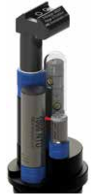
UV•Xchange™ installed on Metrec•X endcap. Configured to protect conductivity, turbidity, and pressure sensors.

Install UV•Xchange™ on a Metrec•X or Smart•X for a high performance in-situ CTD. By eliminating biofouling-induced drift, UV•Xchange™ allows sensors to perform to their full potential for the duration of long-term, in-situ deployments. Like all other members of the Xchange™ suite of products, UV•Xchange™ is field-swappable and easily configured to fit the needs of any operation. Installed directly on the end cap of an X•Series instrument, the module can be set to various positions, enabling optimal coverage of all sensors requiring protection. UV•Xchange™ can also be installed on Micro•X as a standalone option for other instrumentation. When used in applications with limited power supply, UV•Xchange™ can be wired independently from the sensor load to optimize the power budget.