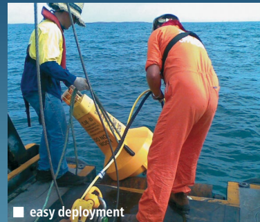
■ easy deployment