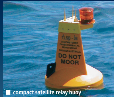
■ compact satellite relay buoy